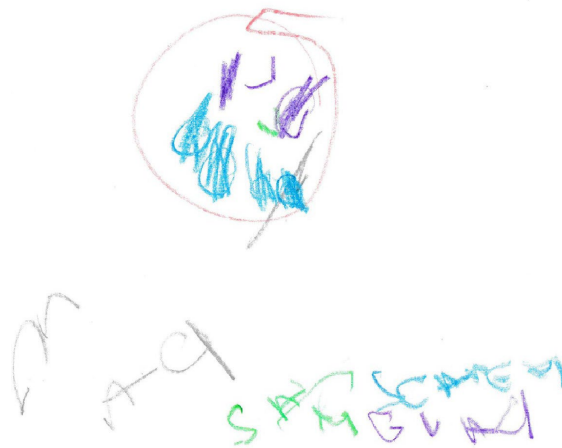
Figure 3. Five-year-old victim of neglect: ARND & Neglect

In Figure 2 one atypical color is used for the feeling, “Glad,” and a high proportion of the feeling, “Sad” is in the drawing. This fifteen-year-old girl felt conflicted and torn between her mother and father who were engaged in a bitter custody battle over this child and her ten year old brother. The girl was brought to treatment because of depression, falling grades, anger outbursts, and defiance.