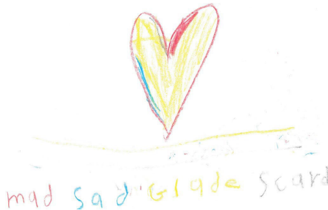
Figure 1. Eight-year old drawing by typical or “normal” child

Non-normative color choices usually reflects that the child can define what the word means, but either cannot identify the emotional experience or had some difficulty with that emotion. Although there is some variation in the normal proportion of each color within the heart the emotion glad is dominant in normative children; typically greater than 60%. Traumatized children and those with disorders of attachment typically make unusual color choices and have color proportion indicative of emotional dysregulation. Typically, the feeling “glad” will occupy less than half the heart, while one or more of the other feelings will occupy one quarter or more of the heart. When the heart is colored in a disorganized or fragmented manner that can reflect executive function impairments. Figure 1 demonstrates a normal drawing with appropriate color choices and proportion of each color within the heart.