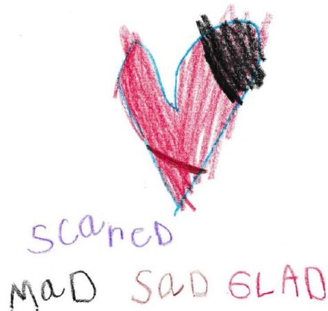
Figure 7. Seven-year-old: Reactive Attachment Disorder