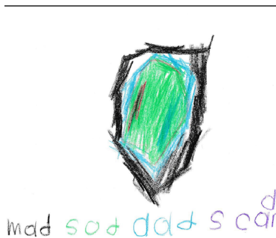
Figure 6. Six-year-old: victim of physical and sexual abuse

First, it became apparent that children who used stereotypical colors tended to have notably more demonstrated age-appropriate affect regulation capabilities than children who selected atypical colors. These impressions became apparent as therapy progressed and in a review of the child's history and presenting problems. In addition, in some instances the Heart Drawing was administered at the end of treatment and in all instances it was found that children who had selected atypical color(s) during assessment, used typical colors for the emotions at the end of treatment.