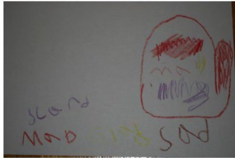
Figure 9. Ten-year old: prenatal exposure to methamphetamine and alcohol