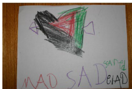
Figure 8. Nine-year old: Bipolar disorder